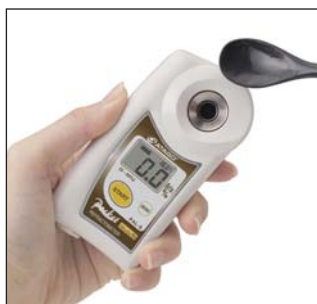
Place a sample on the prism.