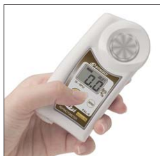
Press the START key.