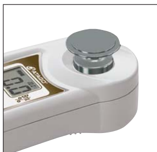
Put the provided MAGIC™ on top.