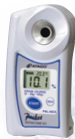
▲ PAL-03CS Cat.No.4393