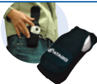
▲ PAL-CASE RE-39409