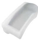
▲ PAL Silicone Cover RE-39413