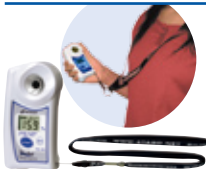
▲ PAL-STRAP RE-39410