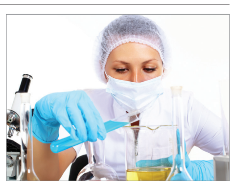
Measure surfactants, anti-rust agents, metal-working fluids, and other industrial solutions at ±0.005% Brix accuracy.